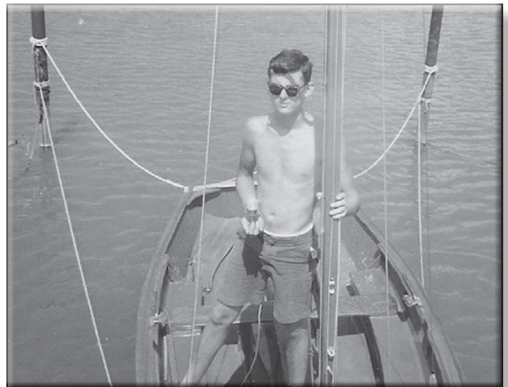
Who is this dashing young SSC sailor? See For the Good of the Order for the answer.