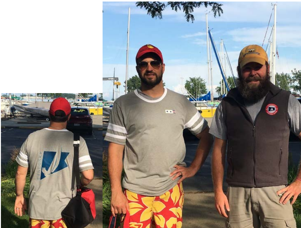
Men's Vintage T-Shirt – Extra Detailed, Relaxed Fit, Sharp Grey w/ Crisp White Accent 50/50 Cotton/Polyester SSC Flags on Left Chest, SSC Large Logo on Back Sizes: Small to X-Large Price: $22.00