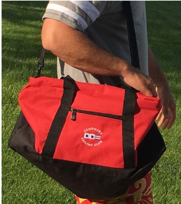
Duffle Bag – Heavy Duty Polyester with Adjustable Shoulder Strap, Top and Side Grip Handles, Front Zippered Pocket Red and Black with SSC Flags on Front Size: 22" x 11" x 10 ½" Price: $25.00