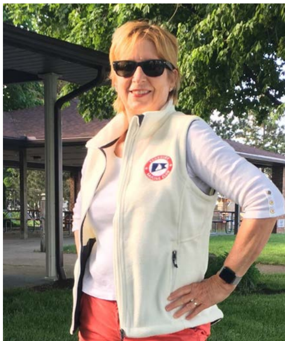
Women's Vest – Crisp Winter White, Front Zippered Pockets, Drawcords for Adjustable Hem Super Soft 100% Polyester SSC Logo on Left Chest Sizes: Small to X-Large Price: $29.00