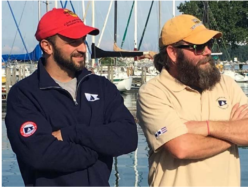
Unisex Quarter Zip Sweatshirt – Soft and Cuddly 50/50 Cotton/Polyester, Won't Shrink SSC Burgee on Left Chest, SSC Logo on Right Upper Arm Sizes: Small to X-Large Price: $32.00