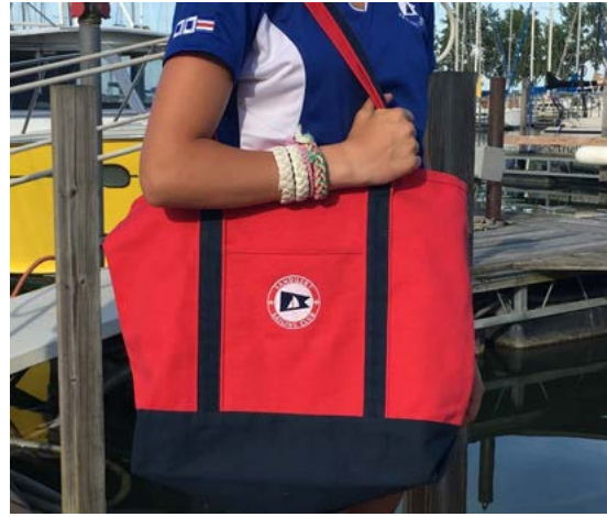
Beach Tote – Outside Pocket and Velcro Closure at Top 100% Cotton Canvas Red with Navy Bottom and Straps, SSC Logo on Front Size: 21 ½" x 15 ½" x 6 ½" Price: $20.00