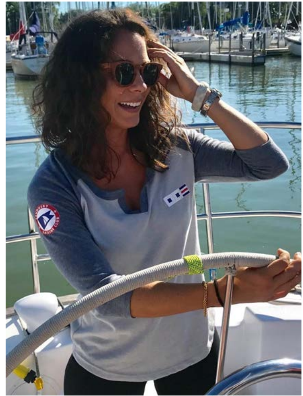
Women's Vintage T-Shirt – Extra Sporty, \frac{3}{4} Length Sleeves Silver Body with Soft Navy Detail, Curved Shirrtail Hem for Graceful Fit 50/50 Cotton/Polyester SSC Flags on Left Chest, SSC Logo on Right Upper Arm Sizes: Small to X-Large Price: $20.00