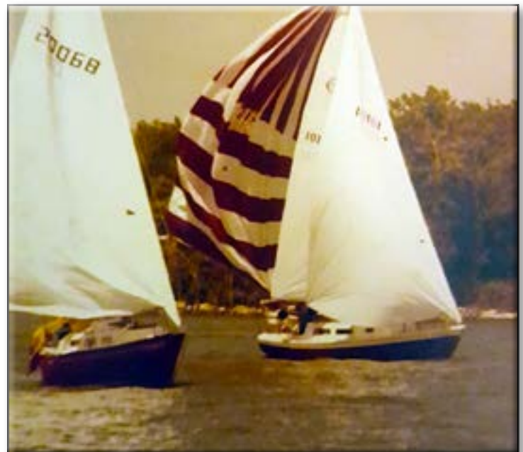
Can you name these two boats and the SSC Past Commodores associated with each?

Late summer sailing - That being said, we still have many weeks to enjoy the balance of summer with Wednesday night racing, Friday night laser racing and Sunday morning racing with open bar hours for libations and fellowship. With a few