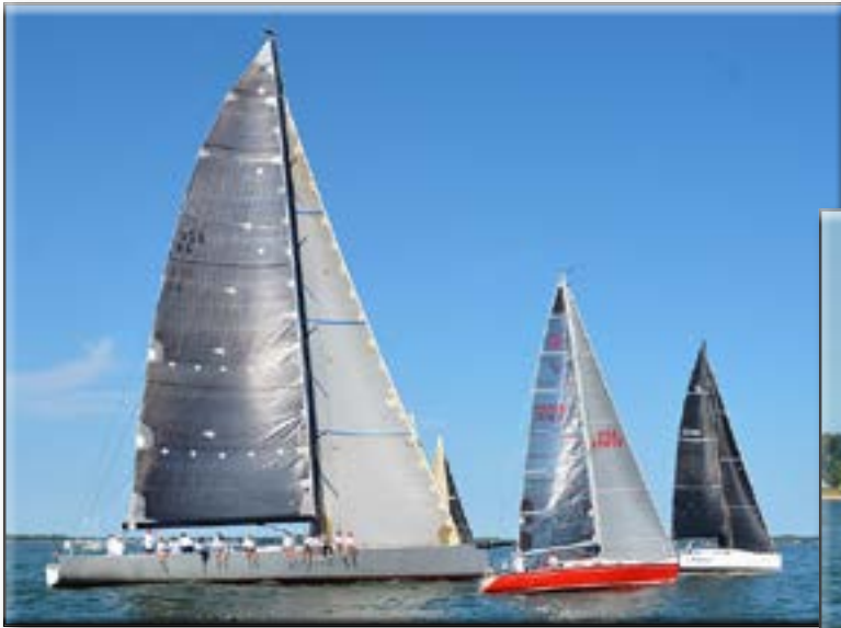
Maverick, an Andrews 80, sneaks up on Shock & All at the PHRF A start.