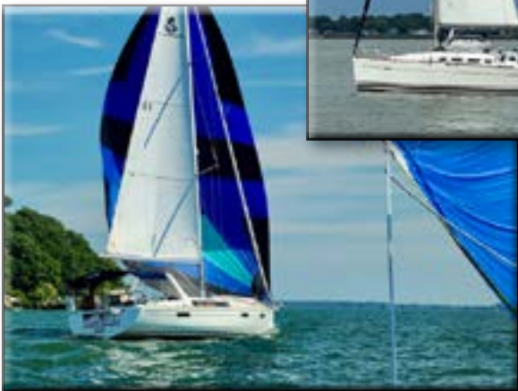
Below: Rob Burger on Storm's Harbor rounding Green Island at Bayweek, just before being passed by Lease Schock on Avatar 2.