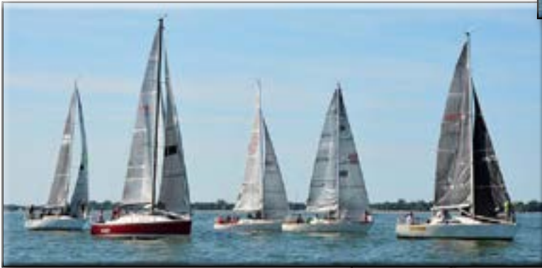
The PHRF B Fleet charges the starting line in the 67th sailing of the Sandusky Islands Race.