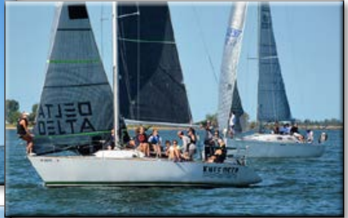
Knee Deep, above, and Maverick, below, challenge each other for the most number of crew.