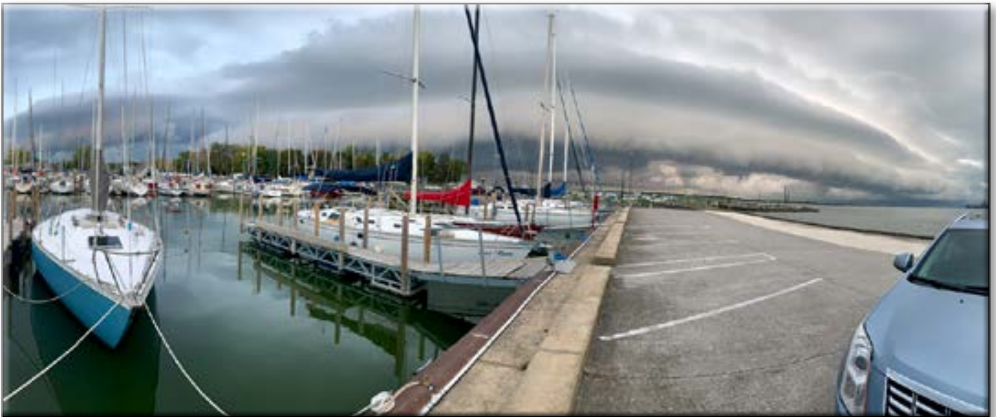
A dramatic fall storm rolls across Sandusky Bay.

Interlake with trailer - Two sets of sails. For info contact Richard Byrd at 216-533-6209 or alphabyrd@gmail.com