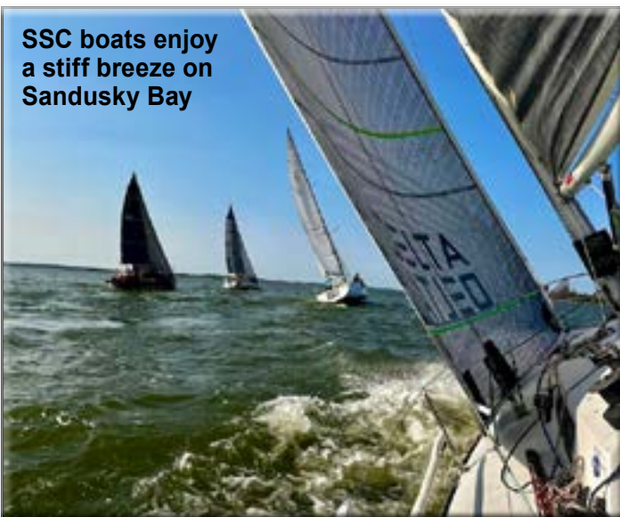
SSC boats enjoy a stiff breeze on Sandusky Bay

For more info, go to www.sanduskysailingclub.com . Go to "community" then drop down to "event calendar."