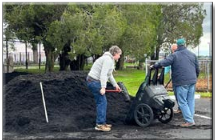
Members spread several truckloads of mulch around the clubhouse on Spring Workday.

Galley rules - It's worth noting again that the SSC Galley is monitored by the Health Department and regulations mandate compliance. So please note that personal food cannot be placed in the galley refrigerator. As always thank you for your cooperation and of course to all of our SSC volunteers.