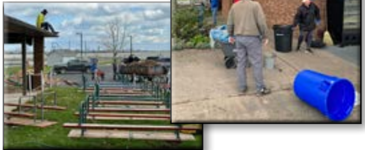
It was an amazing day for spring workday

Please feel free to reach out to me, tim@tendesign.us . I would love your help!