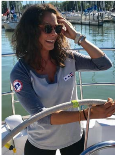
Women's Vintage T-Shirt – Extra Sporty, ¾ Length Sleeves Silver Body with Soft Navy Detail, Curved Shirttail Hem for Graceful Fit 50/50 Cotton/Polyester SSC Flags on Left Chest, SSC Logo on Right Upper Arm Sizes: Small to X-Large Price: $20.00