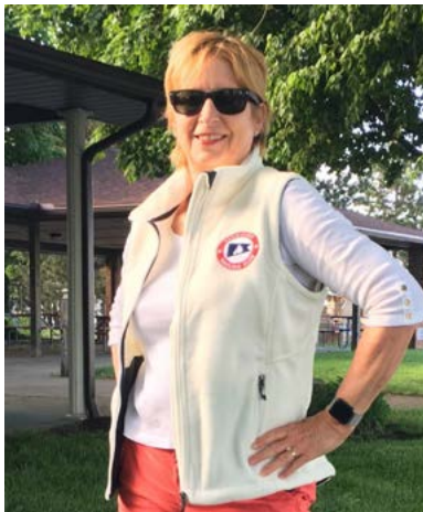
Women's Vest – Crisp Winter White, Front Zippered Pockets, Drawcords for Adjustable Hem Super Soft 100% Polyester SSC Logo on Left Chest Sizes: Small to X-Large Price: $29.00