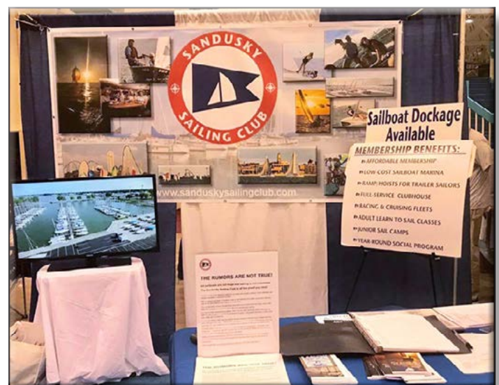
SSC's booth at the Cleveland Boat Show

If you want to contact me , feel free to contact me at john@firelandslocal.com or at 419-706-5137.