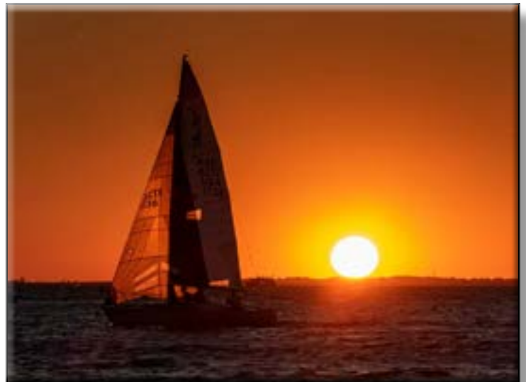
A J/24 sails off into the sunset on a Wednesday night.

Bar Tabs - Please make sure you close out your tabs at the Dairy Bar each night before you leave. If you forget, please make sure to stop down on a night when the bar is open to close out your tab prior to the end of the month. It will skew the bar financials if we carry over sales from the previous month. Call/text 614-940-1565 or email me at ViceCommodore@SanduskySailingClub.com .