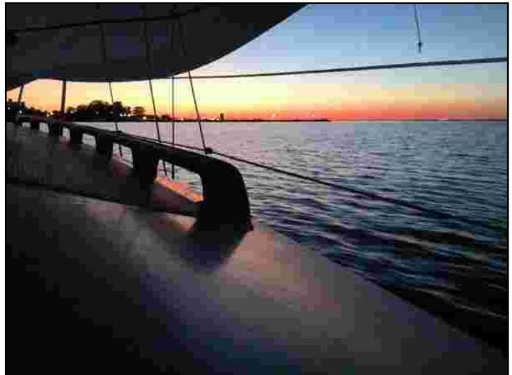
View of the coal docks at sunset from across the deck of David Mears' Ericson 27, Halcyon.

Contact VC Sjoerd VanderHorst at 440-617-9995 or sjvanderhorst@gmail.com if interested.